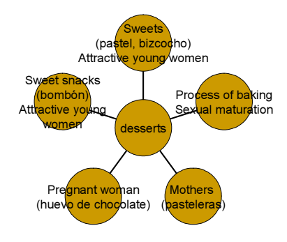
Figure 2. The metaphorical network WOMEN ARE DESSERTS in Spanish