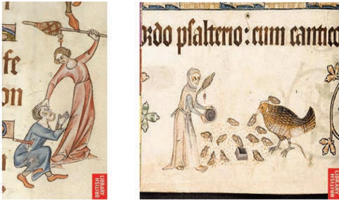
Figure 2. Luttrell Psalter Manuscript. The British Library. 4

The 12 th -century text On Various Arts warns of the dangers involved in reversing gender roles by imagining monstrous creatures like the legendary cockatrice , a monster born from the union of a serpent and a rooster, mentioned as an example of depravity due to the shift of the domestic roles traditionally assigned to men and women. Actually, images of the so-called “maternal roosters” pervaded medieval bestiaries with the didactic purpose of showing the consequences of going against nature and, within a theocentric mentality, ultimately against God (Hodkinson, 2013).