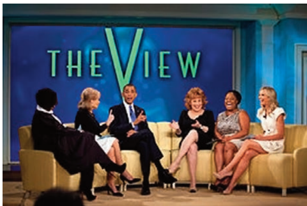
Figure 5. Image of the t.v. talk show The View

http://www.commonsevaluation.com/tag/the-view/#sthash.FBTewafg.dpbs