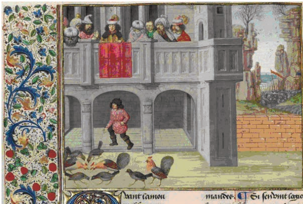
Figure 1. Miniature from Jean Froissart's Chronicles

Being domestic animals, hens came to symbolizing easily manipulated subjects. The miniature from Jean Froissart's Chronicles illustrates a group of hens devouring grain. According to the legend, the Turkish king, pictured in the balcony, threatened to send an army equaling the number of grains in a bag to attack the king of Hungary, to which the latter replied by having starving hens eat the grain, showing in this way his military power over the citizens.